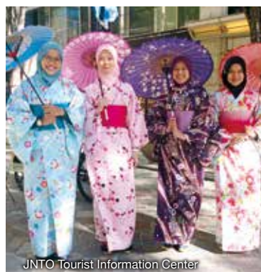
JNTO Tourist Information Center