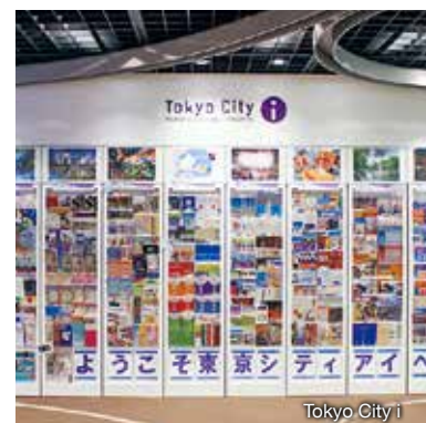
Tokyo City i