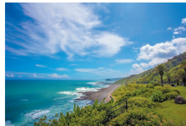
Horikiri Pass

In general, drivers on this plan speak only Japanese, but customers will be given a pamphlet about sightseeing locations on board.