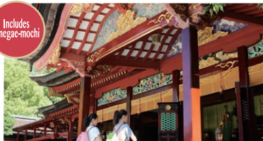
Dazaifu Tenmangu Shrine

Receive the Dazaifu & Yanagawa Sightseeing Ticket and go on an efficient tour course around the sights in Dazaifu and Yanagawa, including a pleasant ride on a river boat!