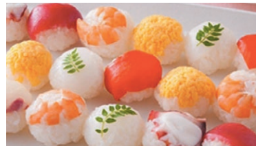
Sushi & Tempura Course

Whip up some Japanese home-style cooking together with the instructor in their kitchen. Through this experience, you'll have the opportunity to deepen your understanding of Japanese culture.