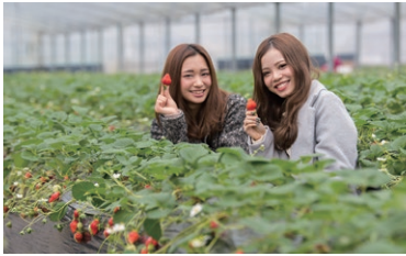
Fruit Picking [Photo for illustrative purposes only]

Enjoy picking seasonal fruits at Fukuoka, one of Japan's most prominent fruit-producing areas. Eat as much fruit as you like!