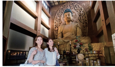
Tocho-ji Temple

Enjoy sightseeing aboard a taxi as the driver makes use of a multilingual interpretation service over the phone to assist customers in their preferred language.