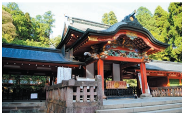
Kirishima Shrine

Be greeted by a taxi driver at the exit of the International Terminal or Domestic Terminal of Kagoshima Airport, and head to Kirishima Shrine via taxi for sightseeing. Afterwards, the taxi will take you to your designated hotel at Kirishima Onsen.