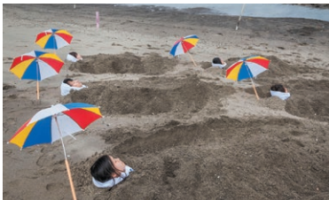
Ibusuki - Sand Steam Bath

Depart from Kagoshima City and enjoy efficient travel around the Ibusuki area on this plan.