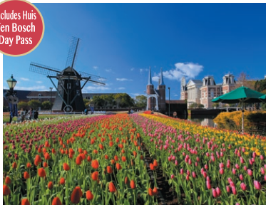
Huis Ten Bosch (Photo for illustrative purposes only)