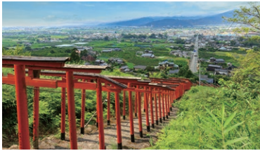
Ukiha Inari Shrine

An English-speaking driver will act as a concierge, guiding you with a vehicle and service that are a rank above the rest. Enjoy pleasant and efficient fruit picking as well as outlet shopping in the Tosu and Ukiha areas.