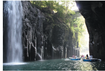
Takachiho Gorge

This course allows customers to efficiently visit Takachiho's sightseeing spots from Miyazaki City.