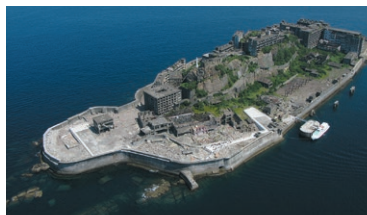
Gunkanjima Aerial View

This course takes participants on a cruise to Gunkanjima Island, which was designated as a World Heritage Site of the "Meiji Industrial Revolution."