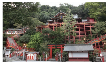
Yutoku Inari Shrine

Be greeted by a taxi driver at the International Terminal exit or Domestic Terminal exit of Saga Airport, and head to Yutoku Inari Shrine via taxi for sightseeing. Afterwards, the taxi will take you to your designated hotel at Takeo Onsen or Ureshino Onsen.