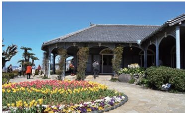
Former Glover Mansion

Enjoy sightseeing aboard a taxi as the driver makes use of a multilingual interpretation service with a tablet device to assist customers in their preferred language.