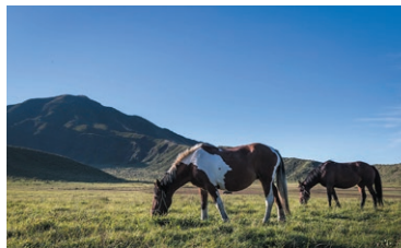
Aso Kusasenri Plain in Autumn

In general, drivers on this plan speak only Japanese, but customers will be given an English pamphlet about sightseeing locations on board.