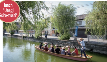
Yanagawa River Cruise

In Yanagawa, experience riding a Donko boat and enjoy a leisurely cruise while taking in the beautiful scenery of seasonal flowers and historical structures along the canals.