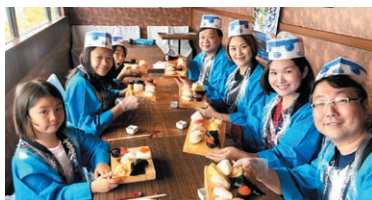
Family at Sushi-making Experience (Photo for illustrative purposes only, courtesy of MHI Fukuoka)

Experience making sushi with fresh ingredients at a location right in sight of the ocean. Receive a certificate to show you completed the sushi school. After the experience, enjoy a delicious sushi lunch!