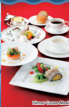
Dinner Course Meal