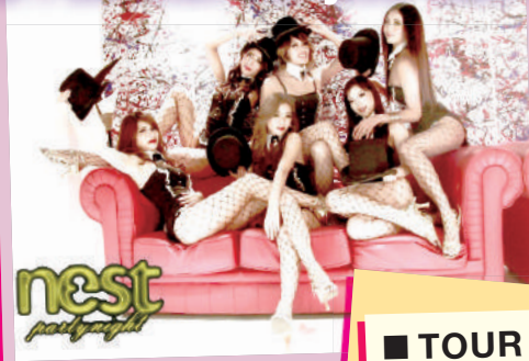
Shinjuku nest Poster