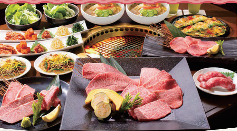
Yakiniku course (sample / for 2 people)