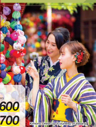
Kimono Dress-up