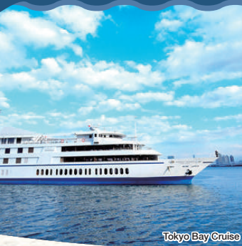
Tokyo Bay Cruise