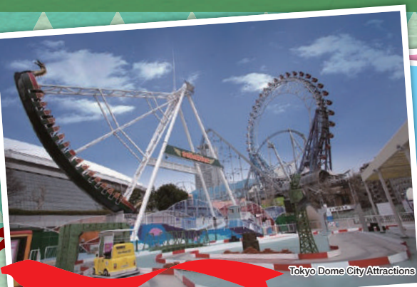
Tokyo Dome City Attractions