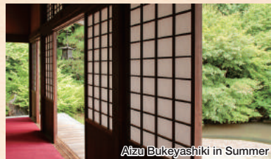
Aizu Bukeyashiki in Summer

[1] Planning Company: JTB Corp. [2] Drivers speak Japanese only. At the meeting location, please board the taxi whose driver is holding a SUNRISE TOURS sign. [3] The tour will charter 1 small-sized taxi.