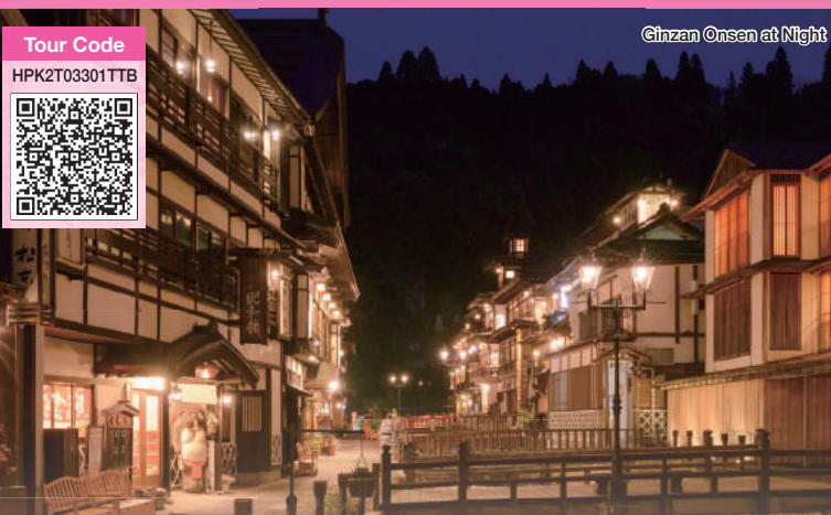
Ginzan Onsen at Night

[1]Planning Company: JTB Corp. [2]Drivers speak Japanese only. The driver will be waiting at the hotel front desk for the outbound trip and at the Zao Fox Village entrance for the return trip holding a "SUNRISE Tours" placard. [3]At the ryokan, customers accompanying children aged 4 or 5 must pay an additional JPY 2,160 at the location for the infant facility use charge. (Meals and futon bedding will not be provided for them. If required, please pay the required additional charges at the location.) [4]For safety reasons, only customers 15 years of age and older may experience petting a fox. Foxes roam freely in some parts of the facility. Adults accompanying young children must take care so as to prevent injuries or accidents. Please be aware that 1 adult accompanying 2 or more elementary school age children are not allowed to enter as there have been many cases where children trip or fall and get hurt or bitten.