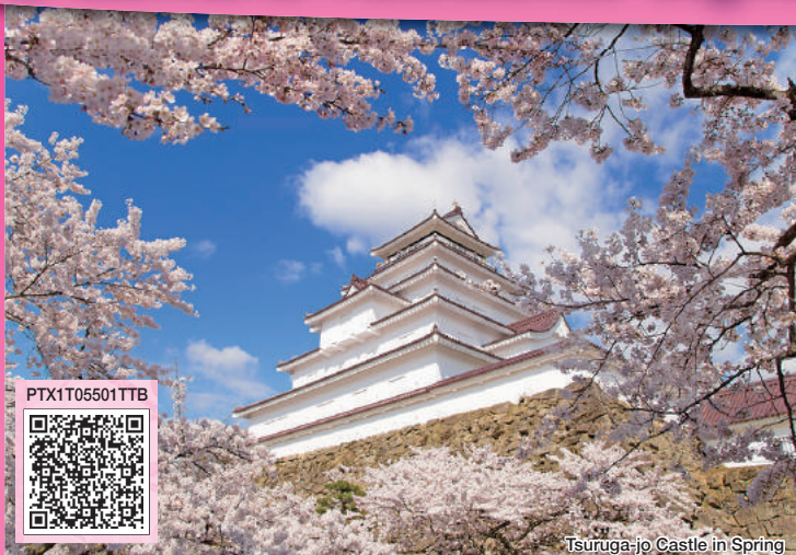
Tsuruga-jo Castle in Spring