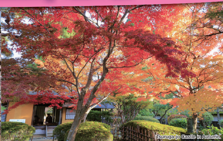
Tsuruga-jo Castle in Autumn