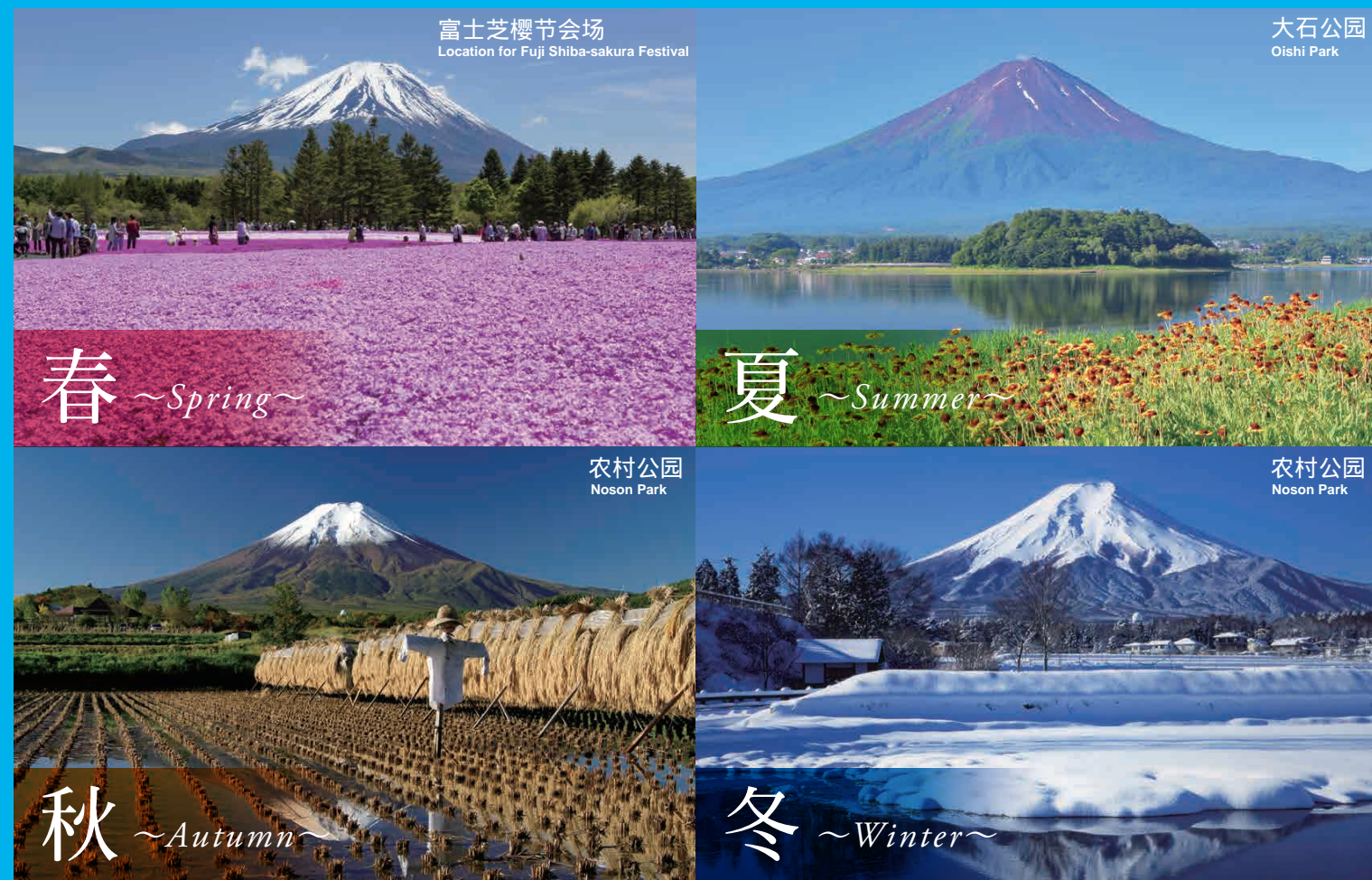
富士芝樱节会场 Location for Fuji Shiba-sakura Festival