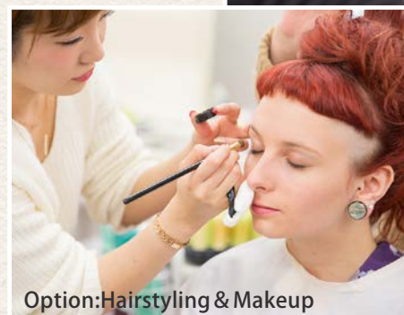
Option:Hairstyling & Makeup

A 100+ year-old machiya with tatami rooms and a Japanese garden where you can feel an authentically traditional atmosphere. Woman kimono rental: 4,500yen/person Man/Child kimono rental: 3,500yen/person Couple kimono rental: 7,500yen/couple