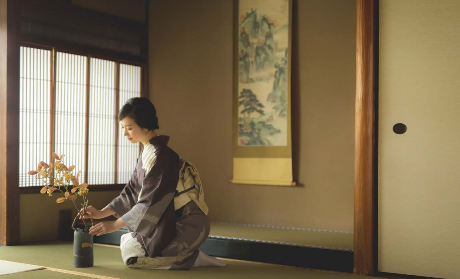
PHOTO Oike PHOTO SESSION

You want a kimono photoshoot in an indoor, traditional space? Only in Oike shop, you can get an indoor photo session with the tatami rooms and the Japanese garden as the background.