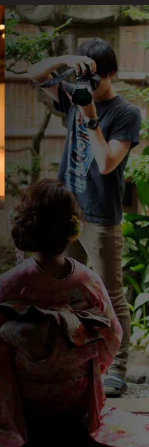
Photo Session 11,000yen (kimono rental and other fees excluded) About 30min for 50 pictures