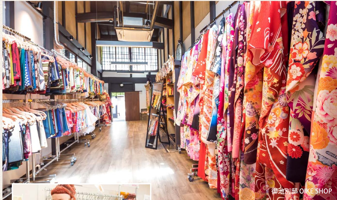
御池別邸 OIKE SHOP

Get dressed in the traditional outfit still worn today in the former capital of Japan to stroll around the city, take pictures, or simply hang out with family and friends!