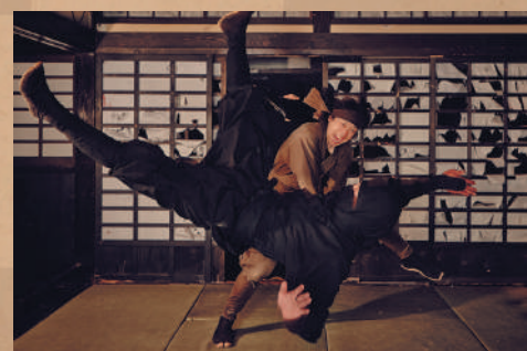
Ninja Karasu Mansion

There are many exciting experiences to try in Edo Wonderland, here are a few of our favorites.