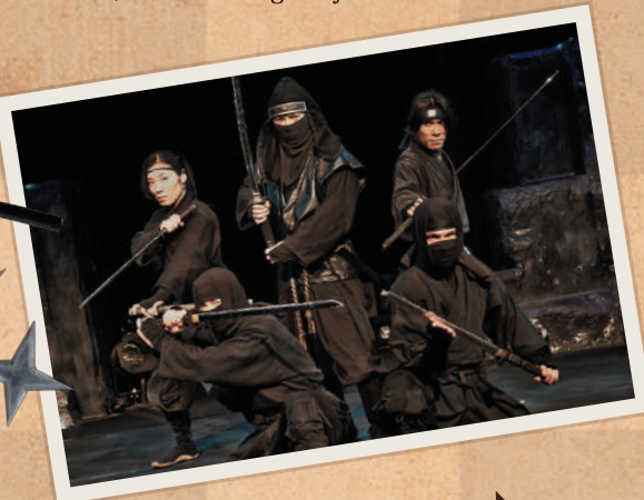
The Grand Ninja Theatre