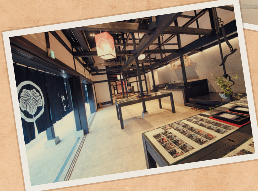
Jiku Kimono Rentals

Enhance your experience in Edo by dressing up in Edo clothing and becoming a local for the day. There is a huge range of adults and children's characters to choose from, such as policeman, samurai, princess or even a lord to mention a just a few. Dressing as a ninja is popular for children.