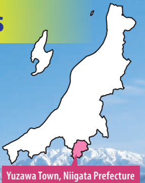
Yuzawa Town, Niigata Prefecture

Echigo-Yuzawa – a Land of Seasonal Traditions