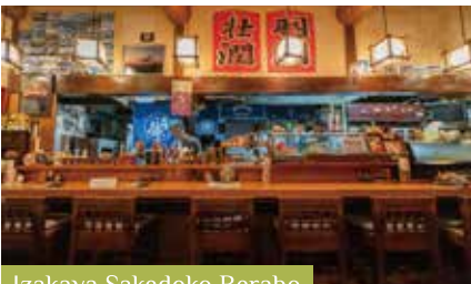
Izakaya Sakedoko Berabo

| Contact Mitane Town Tourist Association for more info. |