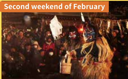
Namahage Sedo Festival | Oga, Akita

An envoy of demon-like gods called Namahage descend from the mountains wearing threatening masks and straw robes. The Namahage perform dances to pray for good harvests, and for protection from disease and disasters.