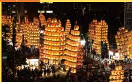
Akita Kanto Festival | Akita, Akita

Bamboo poles reaching up to 12 metres tall and carrying up to 46 paper lanterns are paraded through the streets of Akita City. Performers don't just carry these heavy bamboo poles, they also use their body to balance them.