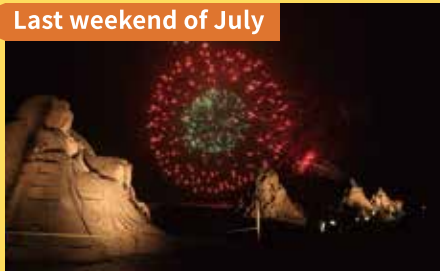
Mitane Sand Craft Festival | Mitane, Akita

This fun summer event showcases the works of professional sand sculptors from across Japan and the world. Apart from the funky sand sculptures, you can also enjoy live performances, festival food, and fireworks on the beach!