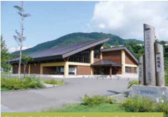
Shirakami Sanchi World Heritage Conservation Center Fujisato-kan

| Head to visitshirakami.com for more info. |