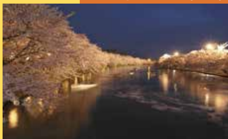
Hirosaki Cherry Blossom Festival | Hirosaki, Aomori

Cherry Blossoms in the Tohoku region bloom almost one month later than those in the Kanto area due to the region's higher latitude. Cherry blossoms season in the north runs from late April to early May.