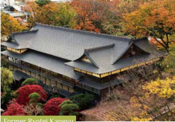
Former Ryotei Kaneyu

Kaneyu first opened as a high-end traditional Japanese restaurant ( ryotei ) in 1937. Surrounded by a beautiful Japanese garden, the building was constructed and decorated using locally sourced cedar trees. Kaneyu is regarded as a symbol of Noshiro, and has been listed as a Registered Tangible Cultural Property. At Kaneyu you can try on a simple kimono for only 500 yen/hour, go on a guided tour of the facility, and have a cup of coffee or tea in the cafe area. If you make a reservation in advance, you can also enjoy a lunch or dinner here. Kaneyu also sells a variety of local souvenirs.