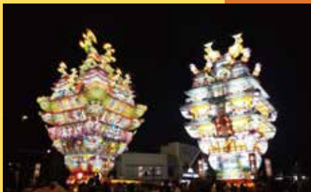
Tenku no Fuyajo Festival | Noshiro, Akita

The Tenku no Fuyajo Festival occurs during the Tanabata festival season in summer. It features Japan's tallest castle-shaped lantern floats, which are paraded through the streets of Noshiro to the sound of taiko drums and traditional flutes. The tallest float reaches over 24 metres!