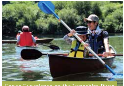
Canoe Experience on the Yoneshiro River

Cherry blossoms in the spring, Japanese maples in the fall, dramatic cliff faces, and even a river, this scenic park has everything a nature lover could ask for! Kimimachizaka Park is also popular as a date spot thanks to its romantic history. As Emperor Meiji travelled through Japan's northern region in 1881, his wife sent a love letter to this park to be presented to him upon his arrival. Later, the emperor named the area kimimachi, which can be translated as "wait for you". Visitors to this park often go to Koibumi Shrine to pray for love and romance, and ring the bell of eternal love. The park features a small cafe, picnic tables, and a few short walking trails.