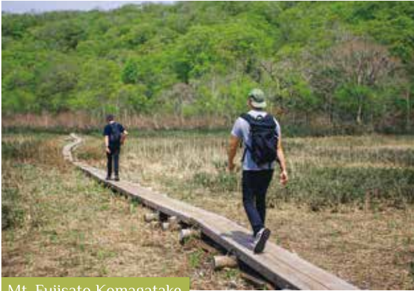
Mt. Fujisato Komagatake

One of the tallest peaks on the Akita side of Shirakami Sanchi, Mt. Fujisato Komagatake (1,158 m) is a fun hike if you're really looking to work your muscles. About an hour's drive from Fujisato-kan, the hiking course will take you through Tanashiro Marsh – which transforms into a field of alpine flowers in spring – Shirakami Sanchi's representative beech forests, and an expansive view of the protected "core zone". A round-trip of this hike takes close to four hours.