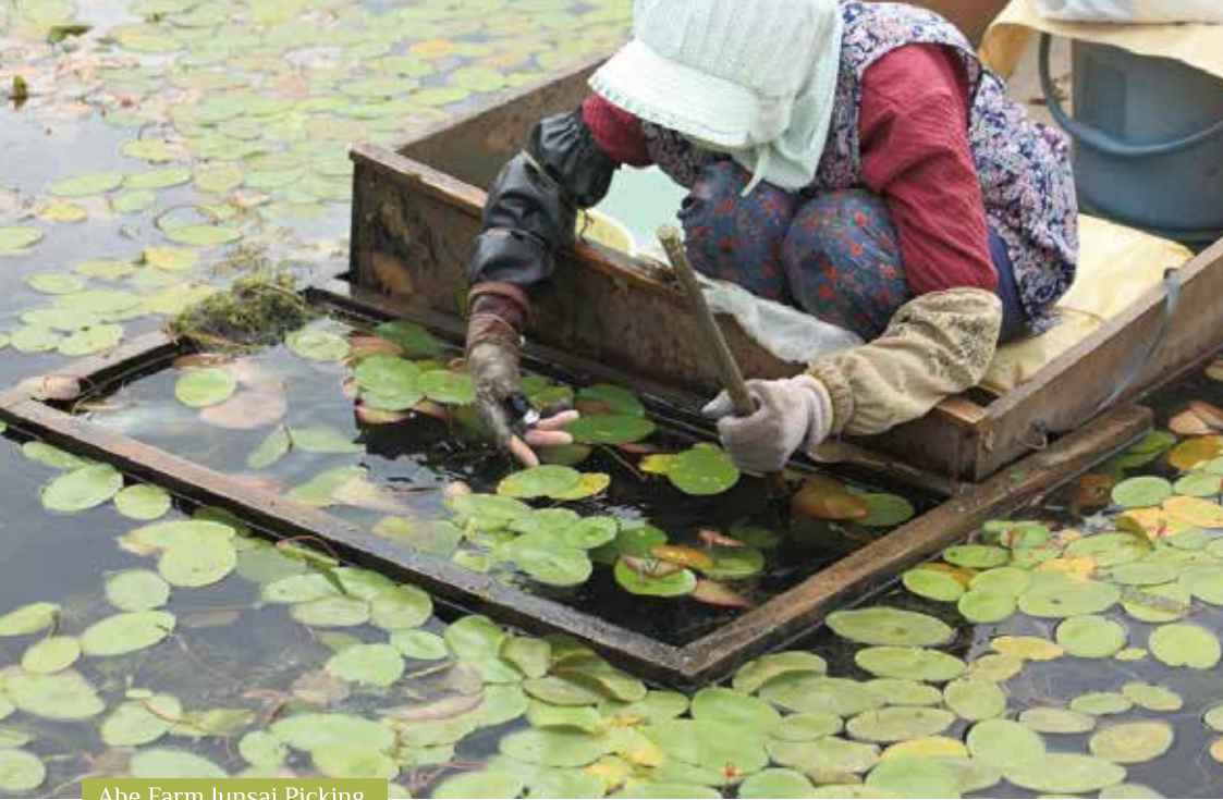
Abe Farm Junsai Picking