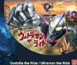
Godzilla the Ride / Ultraman the Ride

*Contents may differ depending on the season.