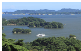
approx. 30 min. from Matsushima