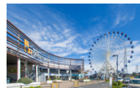
approx. 10 min. on foot from Mitsui Outlet Park Sendai Port