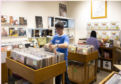
Record Shop "Face Records"

Enjoy panoramic views of Shibuya, coffee and picnics, even skateboarding.