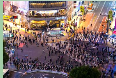
Shibuya Scramble Crossing