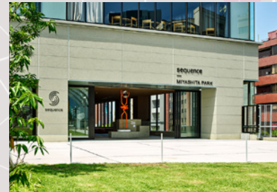
Hotel "sequence MIYASHITA PARK"

The lobby is furnished with materials up-cycled from the original park and guests receive unlimited free coffee and tea with tumblers purchased for their stays.