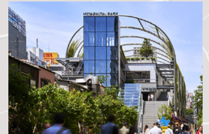
MIYASHITA PARK entrance