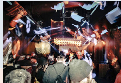
Cafe & Music Bar "or"

A few steps below the park are floors filled with everything Tokyo-cool. Restaurants worth waiting in line for. Only-in-Tokyo specialty shops. Here, LP record and high-end brand shops rub shoulders with office-shares and night clubs. Food, Music, Fashion, Art, Shops. This environment, integrating every kind of culture, is the essence of Shibuya. Come check out for yourself, the dawn of a brand-new era.