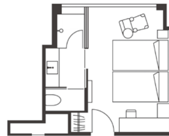
< Twin room example >

Space : 23.0㎡ Bed : W1,100mm×D2,000mm No bath tub, contains shower booth Contains glass partition