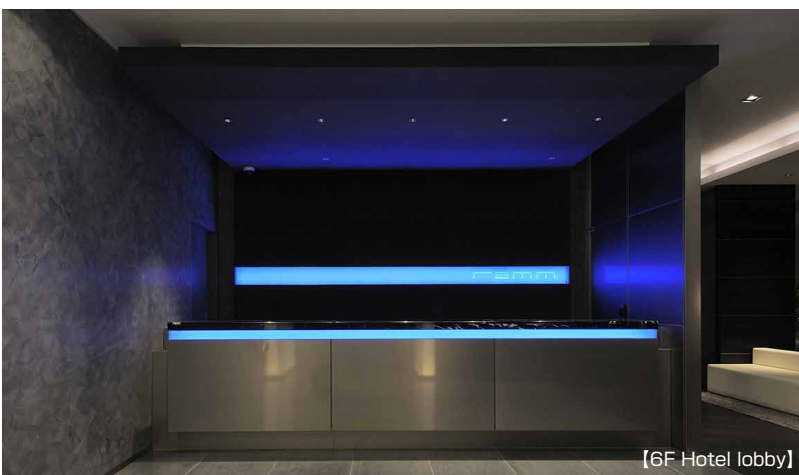
[6F Hotel lobby]