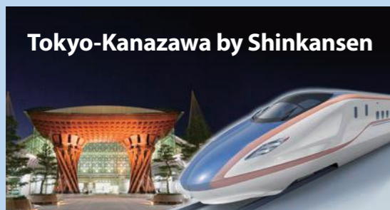
Tokyo-Kanazawa by Shinkansen