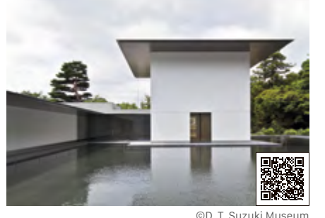
D.T. Suzuki Museum

The museum was designed to be a green park space in the middle of the city. The glass cylindrical architecture of the building is iconic. Artwork that visitors can see, touch, and interact with are spread out across the museum's grounds.