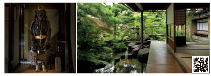
Nomura Samurai Residence

long with history and culture, Kanazawa also has modern attractions including the 21st Century \Pi Museum of Contemporary Art, Kanazawa, which is famous both in Japan and internationally, and districts that house fashionable galleries. Experience Kanazawa, a city where tradition thrives alongside modernity.