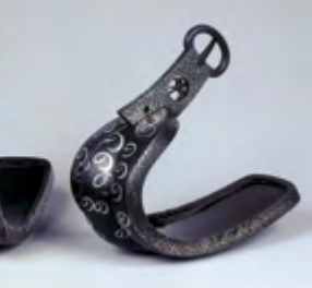
Stirrups with Japanese Character Motifs in Silver In (Kaga-Honda Muse Kaga Zogan (Inlay)