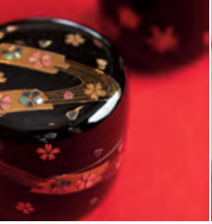
Kanazawa Shikki (Lacquerware)