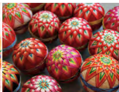
Kaga Temari (Cotton Handballs)