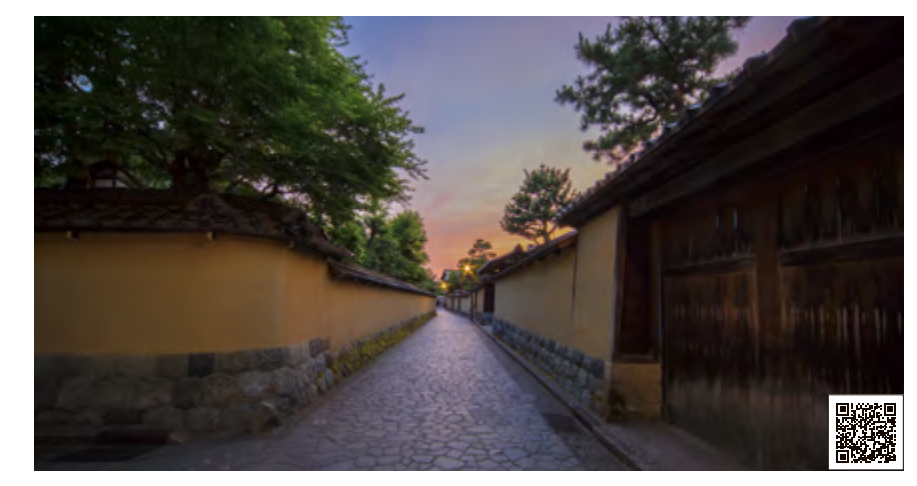
Nagamachi Samurai District

odern-day Kanazawa is one of the largest castle towns in Japan and retains many streets and cultural elements from the olden days owing to the fact that the city has escaped damage caused by war or major disasters for a period of over 440 years. Kanazawa's unique charms include the tourist spots of Kanazawa Castle, Kenrokuen Garden, the long-established fish market, teahouse districts, the samurai district and tradesmen towns, as well as its traditional culture such as crafts, entertainment, and food.