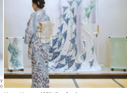
Kaga Yuzen (Silk Dyeing)