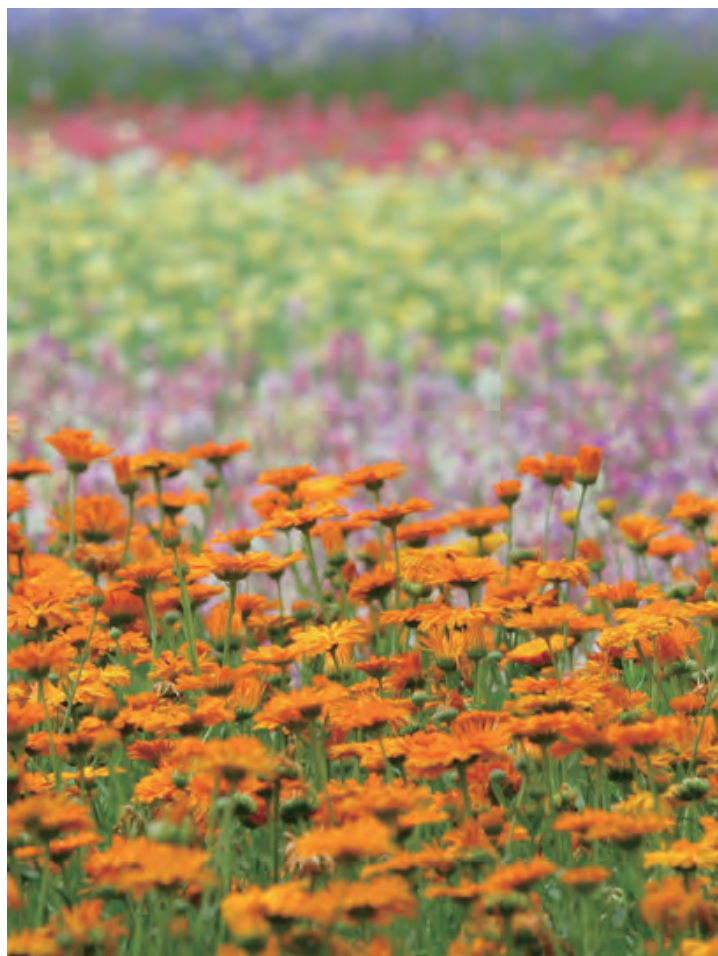
盛夏的花田 Colorful flower field in midsummer