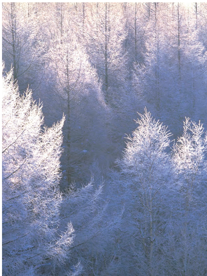
嚴冬的樹林 Trees in severe winter