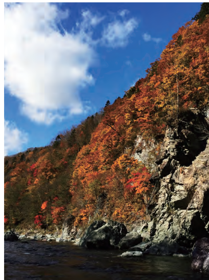
赤岩青巖峽 Akaiwa Seigankyo Gorge