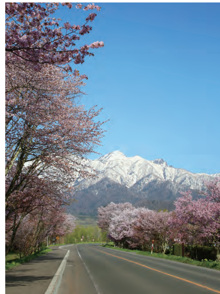
殘雪與櫻花 Long-lying snow patches on mountains and cherry blossoms