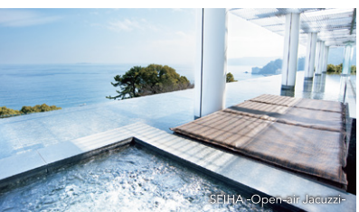
SEIHA -Open air Jacuzzi-