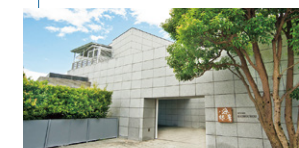
Appearance View of the interior Entrance