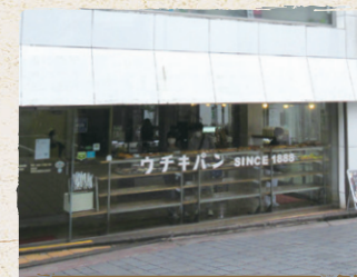
⑤ Uchiki bread

Kirin is a popular company that has a long history of beer in Japan. The Kirin Yokohama beer factory offers free tours of its large brewery as well as beer tasting bar for the visitors.