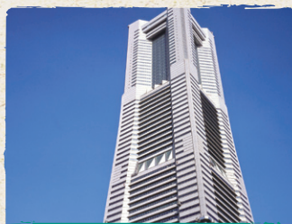
② Landmark tower

Minato Mirai is a Modern seaside area with major tourist sights of Yokohama City with number of restaurants and shops. The night view of Minato Mirai is astonishingly gorgeous.