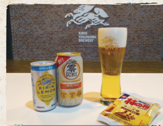
④ Kirin Brewery Yokohama Factory

The Cup Noodle Museum is a popular food museum known for its instant Ramen noodles. The museum exhibits the history of Instant Ramen and the Visitors here can even make their own DIY cup noodles and carry back with them.