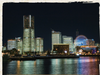
① Night view of Minatomirai

Yokohama is a leading tourism and leisure destination of Japan. It is known for its exotic ambiance, with an amalgamation of the historic and the contemporary. This photogenic city attracts people of all interests.