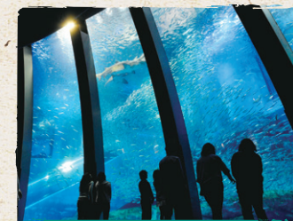
⑥ Yokohama Hakkeijima Sea Paradise

A very famous local bakery at the end of the Motomachi shopping street with variety of freshly baked delicious breads.