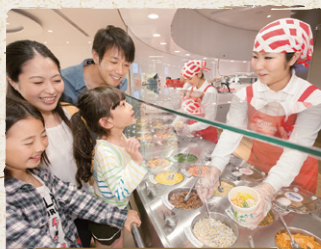
③ Cupnoodles Museum

Yokohama Landmark Tower is the 4th tallest structure in entire Japan. The deck of landmark tower offers an amazing view of Mount Fuji.