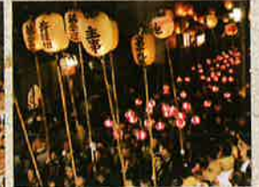
More than a thousand people holding paper lanterns illuminated by candles lead the Okoshi-daiko procession.