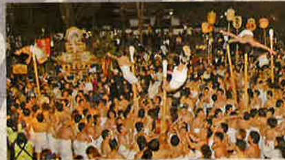
Before starting the parade of Okoshi-daiko, Tsuke-daiko group members take turns balancing atop of the Tsuke-daiko poles.

There are two highlights of Furukawa Festival. One of them is "Okoshi-daiko (rousing drum)," which is held on the night of April 19th. Okoshi-daiko, the big Japanese drum structure, is carried through the streets by hundreds of half-naked men. During Okoshi-daiko parade, the 12 neighborhood groups of men follow the main drum with their small drums called Tsuke-daiko (attaching drums). They become very aggressive and charge upon the main drum, since the position directly behind the drum structure is highly esteemed. Okoshi-daiko represents the DYNAMIC aspect of the Furukawa Festival, which is known as one of the most eccentric festivals in Japan.